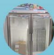
Temperature Control Chamber