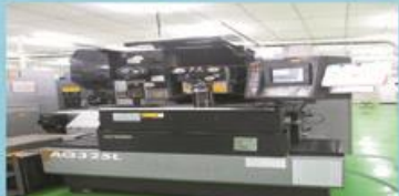
Wire Cut machine AQ325L