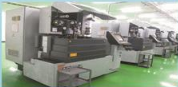
Wire Cut machine AQ327L