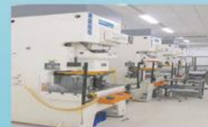
SINO Tech NCP 45 ton Machine