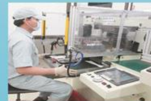
Auto press Machine