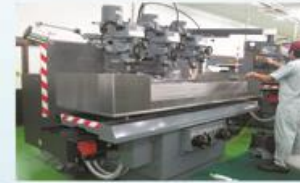
CNC Milling Machine (ANC-3H11a-85)