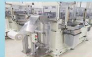
Roll Press Machine