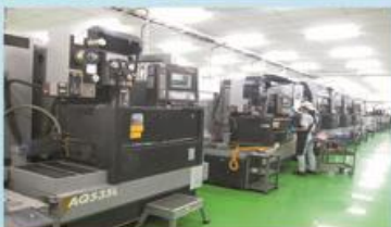
Wire Cut machine AQ535L