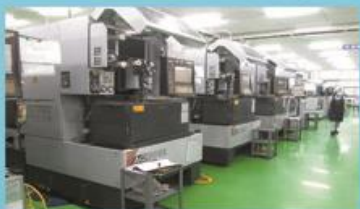
Wire Cut machine AQ300L