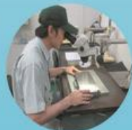
QC Final process