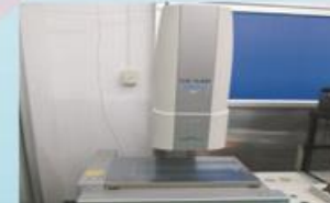
CNC Video Measuring System VMR3020