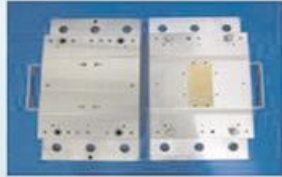
QDC (Quick Die Change)