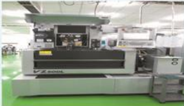
Wire Cut machine VZ500L