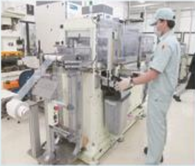
Automatic Press machine:

Press team product will be control dimension and shape by Die and produced by Press Team