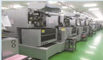
Wire Cut machine VZ300L