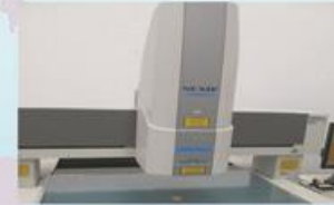
CNC Video Measuring System VMR6555