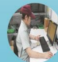
Packing / Shipment