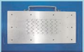
Aluminum Vic Die Stamping Part